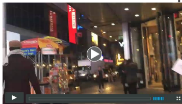
A KID is now on Broadway!