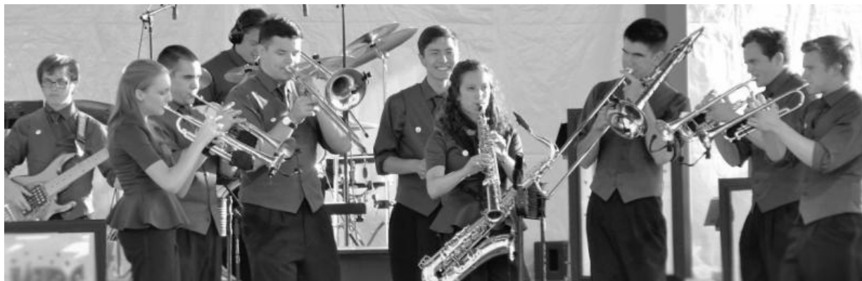
The band is featured throughout the 2-hour performance

http://www.kidsfromwisconsin.org/info/audition/