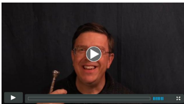
From KID to the Philadelphia Orchestra..