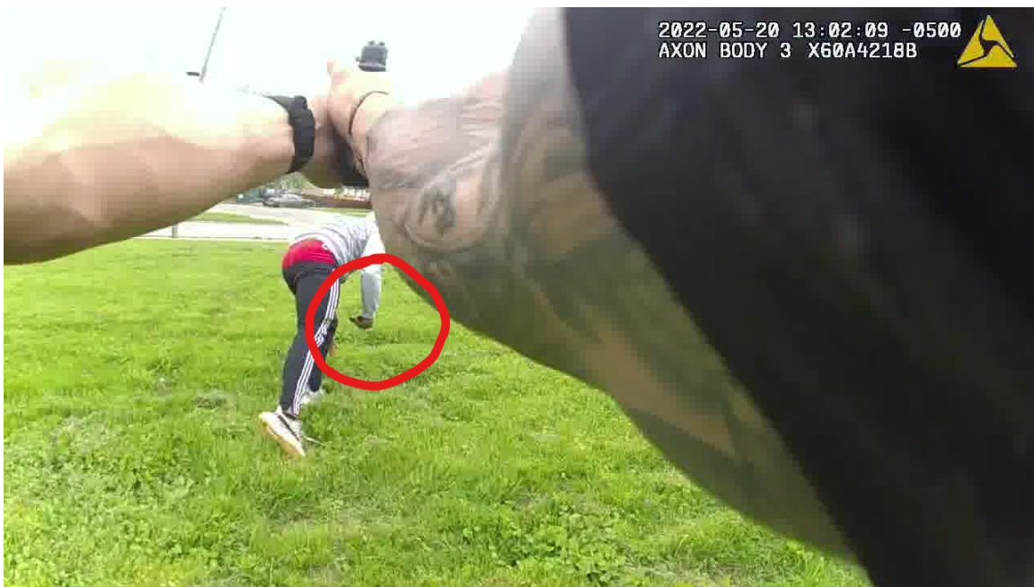
STILL PHOTO #5: Mr. King has retrieved the gun from the ground