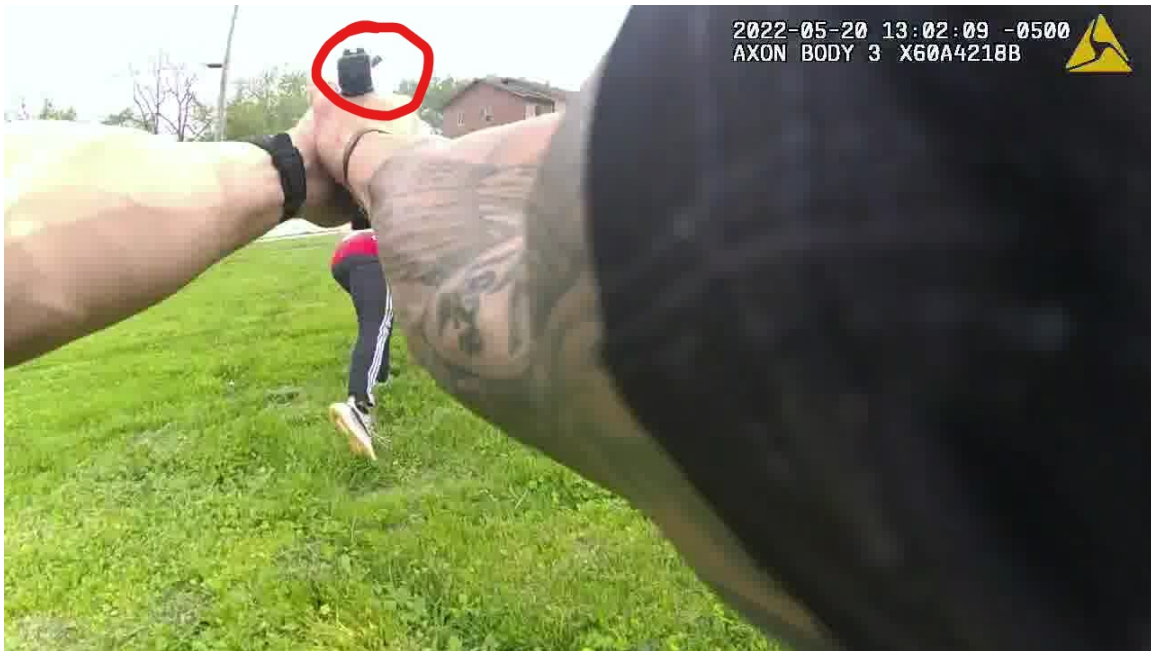
STILL PHOTO #6: Shot 1 fired by Officer Brenner