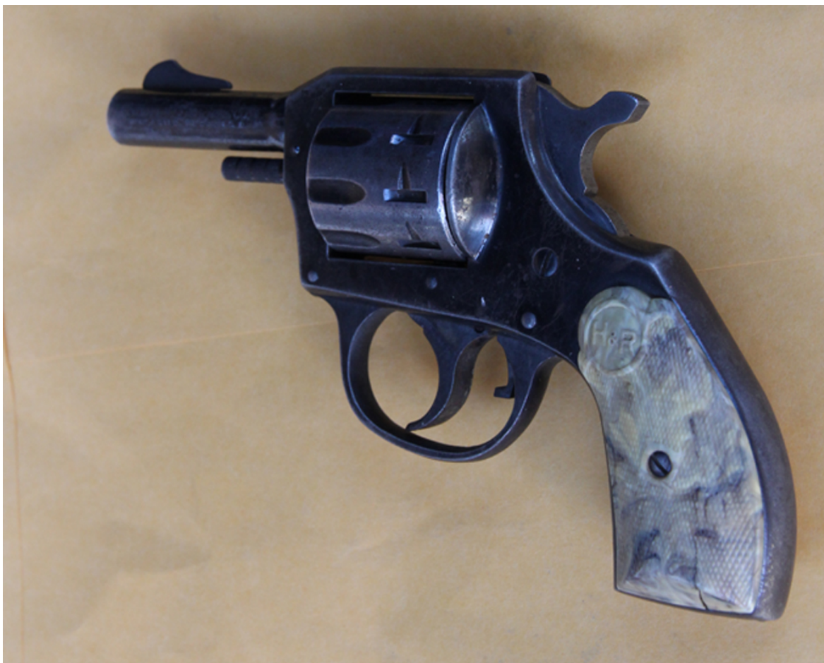
DOJ photograph of Mr. Palaita's Harrington & Richardson .22 revolver.

When tested, the revolver functioned normally in single action, but when fired in double action, the firing pin did not strike the primer of the cartridge with sufficient force to fire the bullet. In other words, to fire Mr. Palaita's gun, a shooter would have to manually cock the hammer/firing pin back each time (single action) to fire the gun in order for the hammer/firing pin to generate sufficient force to strike the cartridge and fire the bullet.