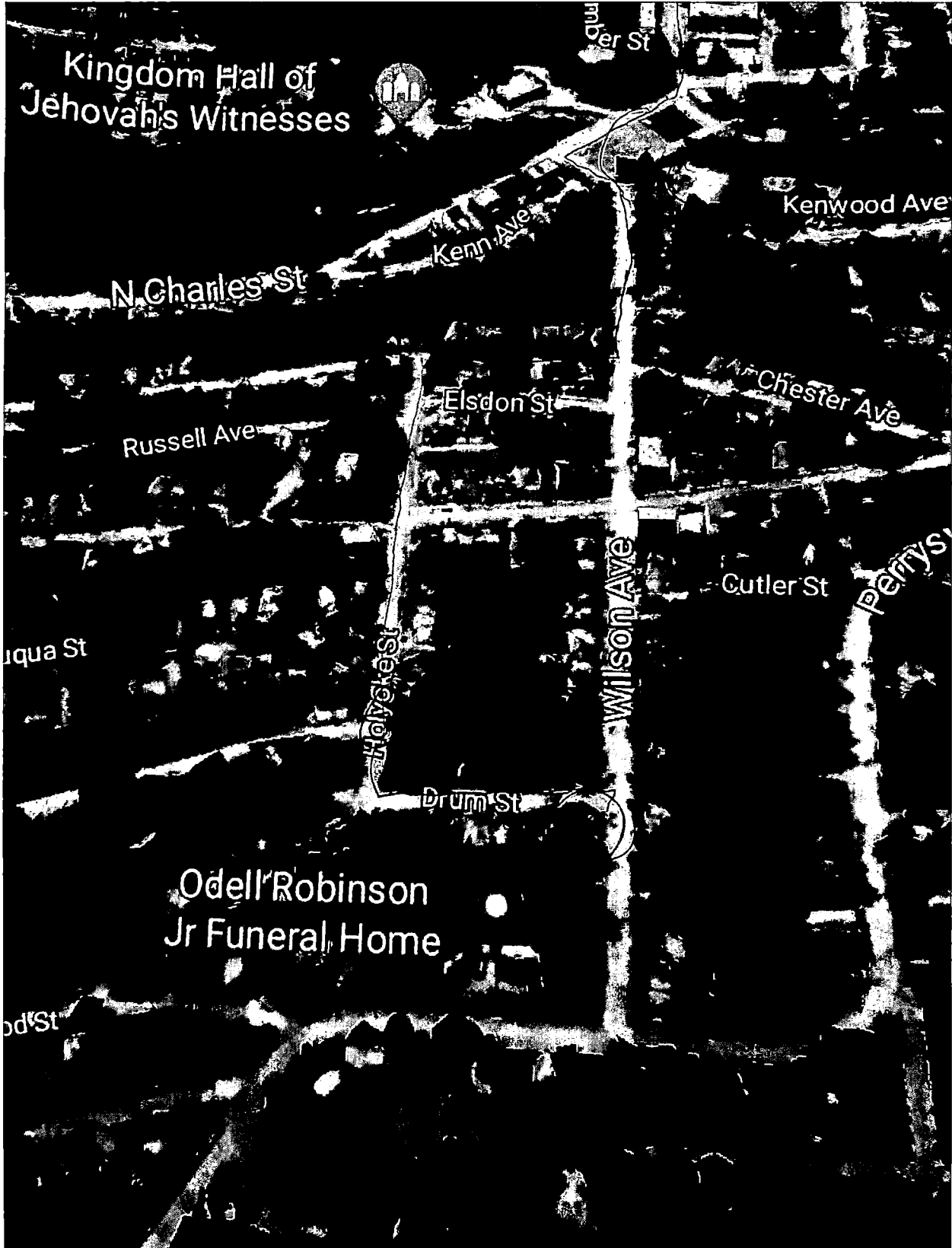
Exhibit 1: Map of Proposed Church Attack Provided by ALLOWEMER